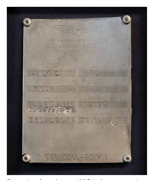
Data plate from Agusta109C helicopter crash

Sometimes, we could offer an alibi, but mostly the case was built on cross examination and closing argument."