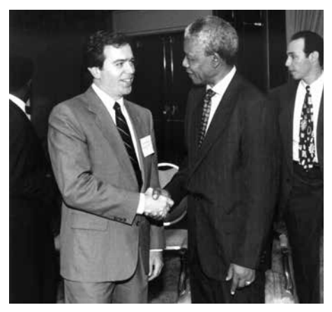
With Nelson Mandela in Chicago in early '90s

Ultimately, discovery revealed that SNFA and Agusta had prior notice that the bearings were failing. Records revealed that the company had to ship bearings to the United States to replace those in aircraft because of their short dependability. "They are supposed